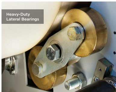
Heavy-Duty Lateral Bearings