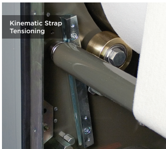
Kinematic Strap Tensioning