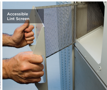
Accessible Lint Screen