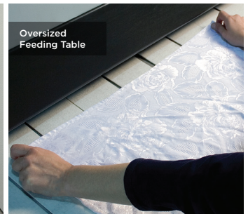
Oversized Feeding Table

Every dry cleaning/fabricare operation is unique, with a distinctive set of production, quality and efficiency goals. Uniquely, Poseidon Flatwork Ironers deliver the flexibility and programmability to meet any wet cleaning need. The Poseidon team works closely with facilities to properly size and install equipment.